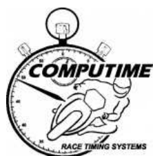
Clerk of Course - Peter Woods